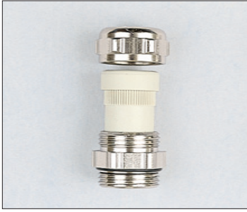
with Santoprene (STP) Tubular Sealing Insert

Nickel Plated Brass (NPB) Santoprene (STP) Perbunan (PRB)