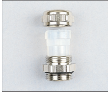
with Silicone (SIL) Tubular Sealing Insert

Nickel Plated Brass (NPB) Silicone (SIL) Silicone (SIL)